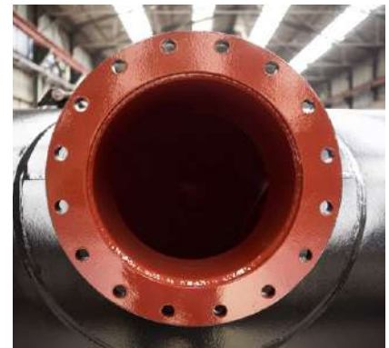
Steel pipes & tubes

Some solutions to replace expendable abrasives by recyclable steel abrasives have been successfully implemented. When slag and garnet sources are becoming scarce and present considerable drawbacks due to excessive generation of dust and waste resulting in low efficiency, it is more cost-effective and efficient to replace expendable abrasives by