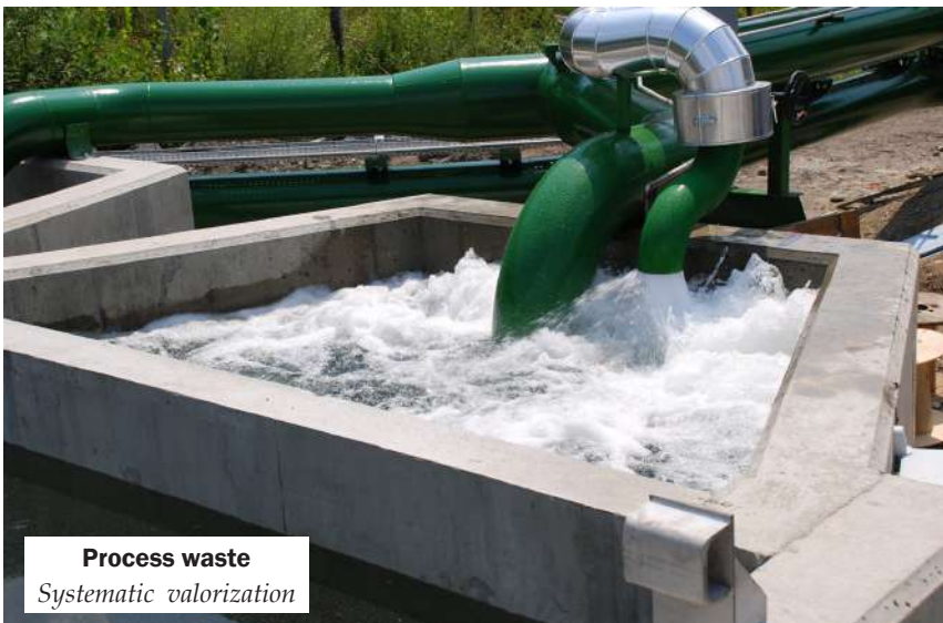
Process waste Systematic valorization