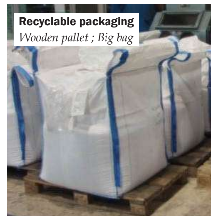
Recyclable packaging Wooden pallet ; Big bag