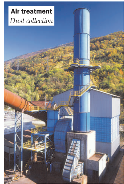
Air treatment Dust collection

At the same time, Winoa has successfully improved its atmospheric releases and its noise emissions in line with its activity. Winoa has worked hard