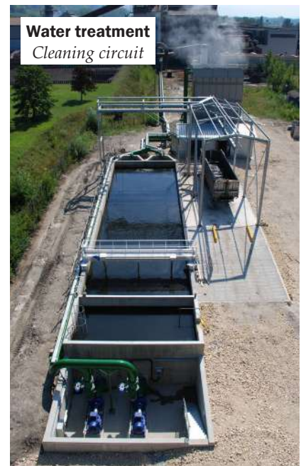
Water treatment Cleaning circuit