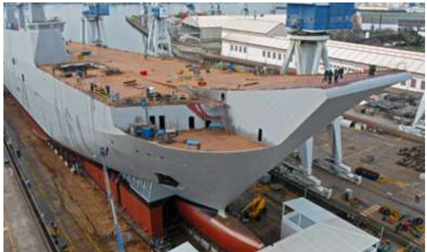
Ship repair shipyards